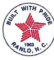
Town of Ranlo Mayor Lynn Black