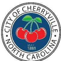
City of Cherryville Mayor H.L. Beam